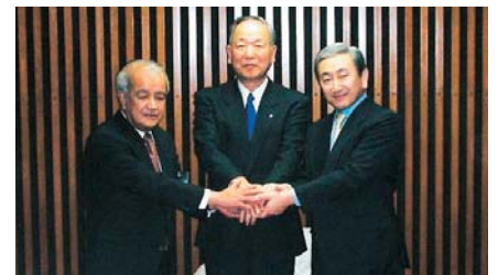
Kochi Prefecture “Cooperative Action for Forest Making” agreement signing ceremony

In taking the initiative with companies in forest making, we are supporting Kochi Prefecture in its progressive efforts for “cooperative action in forest making.”