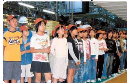
Elementary school students touring the Fujimatsu Plant

The "ST (Getting to Know Toyota Auto Body) Campaign" helps visitors learn more about Toyota Auto Body. We conducted various plant tours such as an "Elementary School Student Social Science Tour" and "Have a Look at How Things Are Made." In FY2006, approximately 7,300 people participated in the ST Campaign.