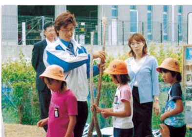
Environmental studies of Kenaf for elementary school students

Approximately 7,300 people participated in FY2006