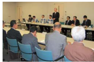
A community discussion meeting to maintain good relations with community members

We report and explain what action is taken concerning the opinions expressed. Also, we are aiming for our employees to interact with members of the community through events held at each plant.