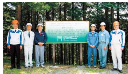
Declaration of support for forest conservation activities in Mie Prefecture

We are supporting “Corporate Forest Making” in Mie Prefecture together with Inabe City at the Inabe Plant.