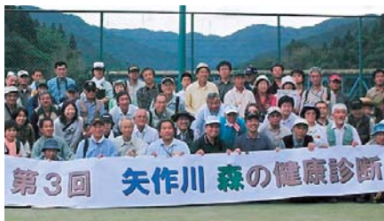
Participating in the forest health check-up project

As a first step in domestic activities, we are supporting the Yahagi Riverbank Forest Volunteer Committee's “Forest Thinning Model Operation” at our headquarters and the Fujimatsu Plant.