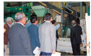
A tour of a recycling facility