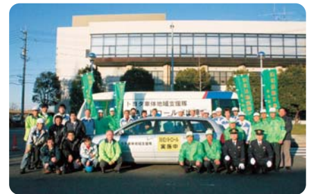
Kickoff ceremony at the Yoshiwara Plant

Toyota Auto Body is making efforts by activities to prevent high incidences of street crimes (purse snatching and car break-ins) through forming "Community Crime Prevention Patrol Groups" in each community, while also coordinating with residents, police officers, and city officials.