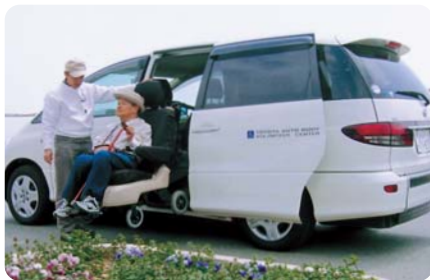
Enjoying our welfare vehicles for going shopping and leisure

In 1998, Toyota Auto Body began a shuttle service (Odekakekun) for picking up and sending off wheelchair-bound disabled and elder people. We have implemented the service in the areas around our plants and also areas close to the cities of Kariya, Chiryu, Toyota, and Inabe.