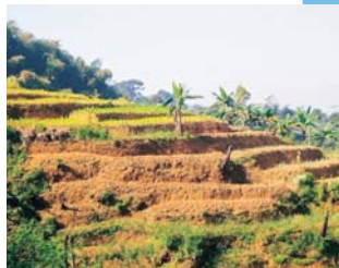
Sukabumi Province Indonesia

Mahogany and others: Trees for furniture, musical instruments, and construction materials Avocado and others : Trees for harvesting fruits