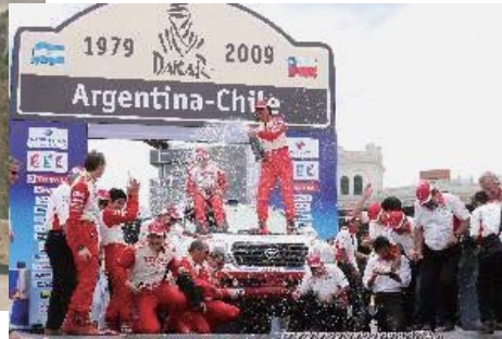
Our fourth consecutive Dakar Rally victory