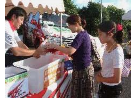
Additional local community Cooperation in gathering disposed cooking oil