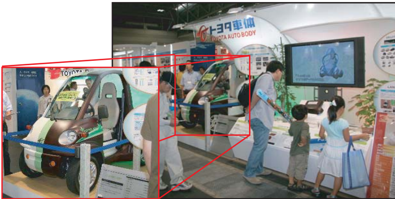
Messe Nagoya 2008

At the People and Vehicles Technology Exhibit, Messe Nagoya, and ENE-WAY, we exhibited our “COMS Bio-plastic,” a very small electric car with body material originally made from plant-fiber materials. We also introduced the content of our efforts and fundamental way of thinking about the environment.