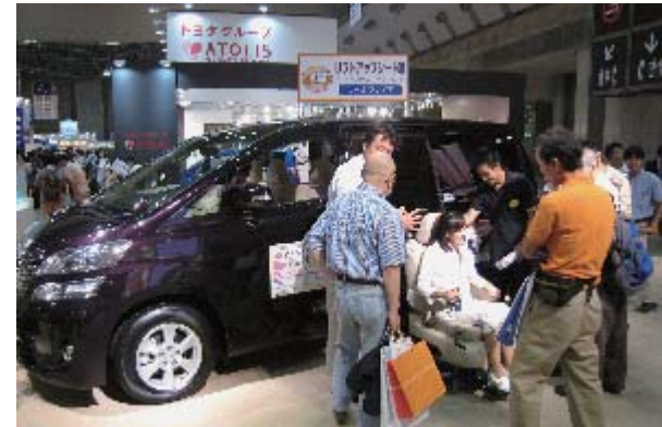
International Home Care & Rehabilitation Exhibition 2008

At the Toyota Motor Corporation booth in the International Home Care & Rehabilitation Exhibition, Toyota Auto Body displayed eight of nine welfare unit vehicles fabricated at our Kariya Plant. In addition, we exhibited our original welfare products at the ATOLIS booth at the exhibit.