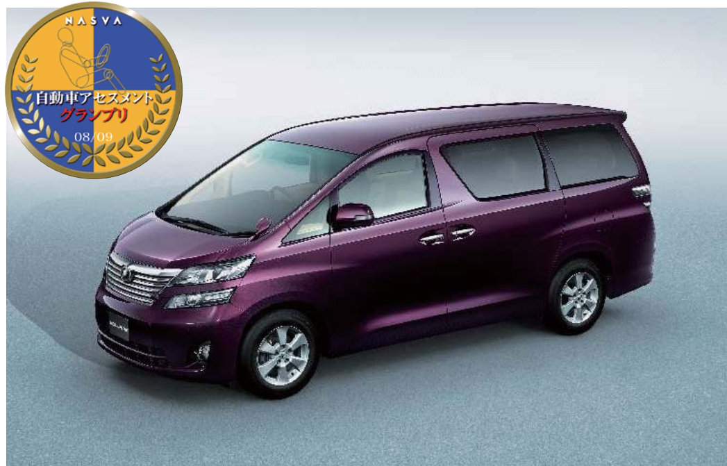
Vellfire that received the highest safety evaluation

After the 2006FY Estima that we manufactured, this is the second time Toyota Auto Body's efforts have been well recognized as evidence of the strength of our high technological developments.