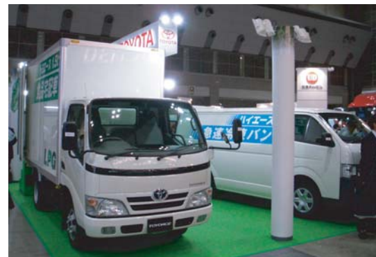
Asia's Largest Material Handling & Logistics Exhibition 2008

At the Toyota booth at the Asia's Largest Material Handling & Logistics Exhibition 2008, we promoted Toyota Auto Body special-equipped vehicles and exhibited three refrigerator and freezer vehicles.