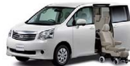
Side Lift-up Seat Vehicle