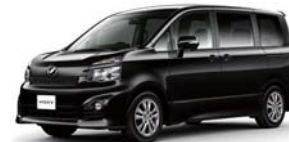
Voxy / Noah