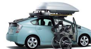
Specially-equipped Friend-Matic Vehicle (Well Carry)