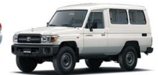
Land Cruiser 70 Hardtop