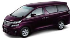
Alphard / Vellfire