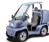
Electric Vehicle COMS