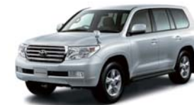
Land Cruiser 200