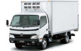
Freezer & Refrigerator vehicle