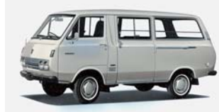
Began production of the Hiace