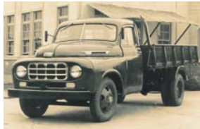
Began production of the BX series truck