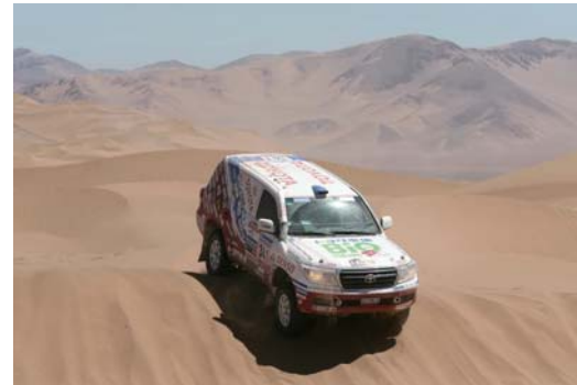
Land Cruiser off road in the Atacama Desert