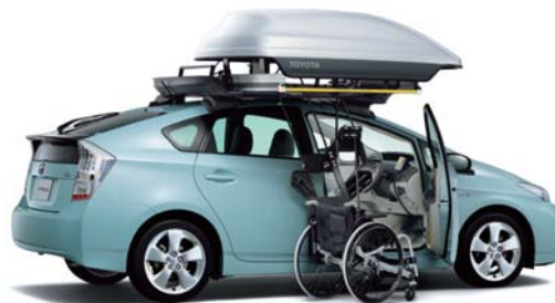
May, 2009 New model Prius debut <Well Carry attached>

Hybrid vehicle bodies and interiors that Toyota Auto Body designed and developed in FY2009