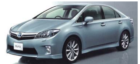
December, 2009 New model SAI debut