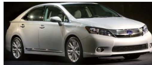
July, 2009 New model HS250h debut (First Lexus hybrid model)