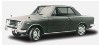
Began production of the Corona Hard Top