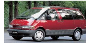
Began production of the Estima