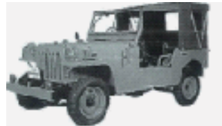
Arakawa Bankin Kogyo KK (Formerly Araco) began production of the BJ Series Toyota Jeep (Currently the Land Cruiser)