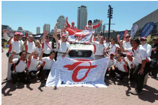
Toyota Auto Body and TLC ※1 members raising a flag written by employees

Toyota Auto Body rally vehicles participated in the Dakar Rally by running on biodiesel comprising a mixture of diesel and fuel refined from used cooking oil recovered from various people in the community ranging from junior high school through college students, as well as families and from Toyota Auto Body cafeterias.