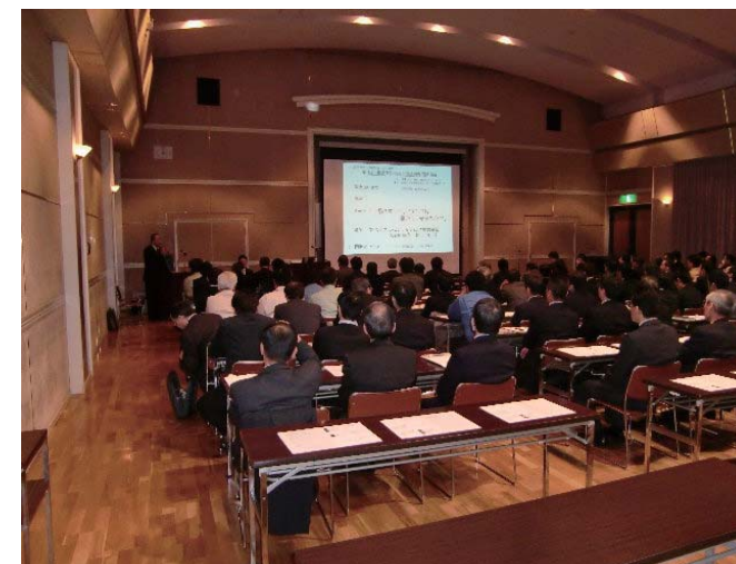
A compliance lecture meeting

In FY2009, in addition to lectures on compliance and safety, there are electronic vehicle lectures as part of our environmental efforts that address the times with pragmatic research activities. In FY2010, we are progressing with activities that incorporate our policy of addressing important management issues.