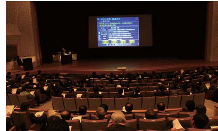
Procurement policy presentation meeting

Through these activities, we are working toward growing and expanding by even further strengthening coordination with our suppliers.