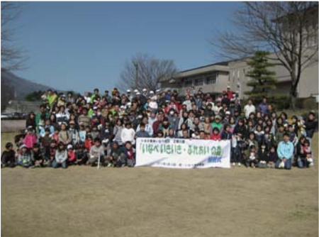
Tree planting event in Mie Prefecture (270 people participated including local community residents)