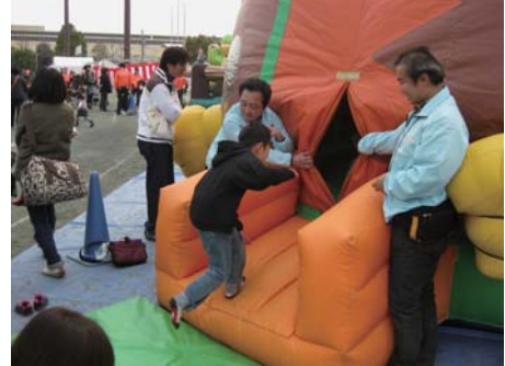
“Fuwafuwa” managing operation at exchange events of Toyota Auto Body and the community