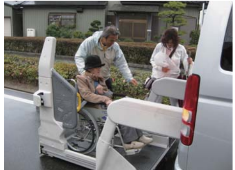
Wheelchair user transport service