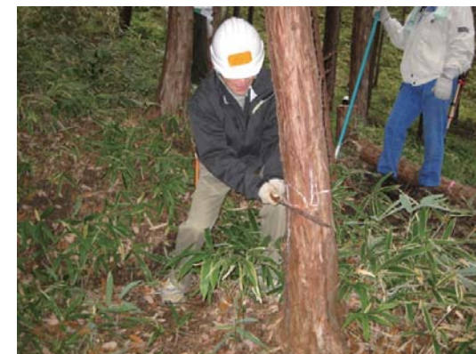
Employee experiencing forest thinning