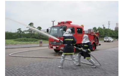
Special Self-Defense Fire Unit performing fire fighting drills (Life Service and Security Corporation)