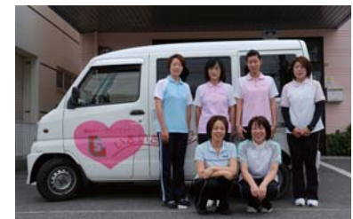
Staff that visit homes to assist people to bathe safely (Life Support Co., Ltd.)