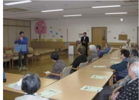
Welfare facility special presentation