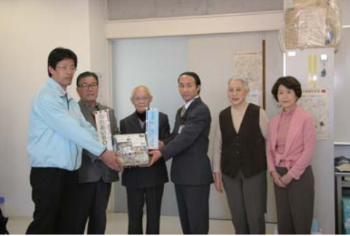
Contributing used stamps (Kariya City Social Welfare Council)