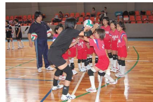
Volleyball lesson (women's volleyball club)