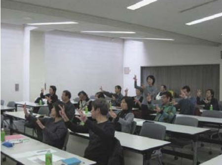
Sign language taught in social welfare classes and study of shorthand basics