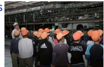
Plant observation tour

Established through a recruiting entrepreneurship, this company comprehensively supports total welfare planning for various needs of an aging society. Through eight sections, which include rentals and sales of care service products, the company is also involved in providing home help, day service, and creating care planning.