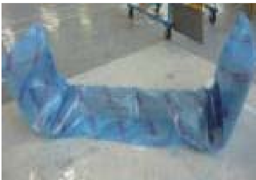
Packing by using aircaps

In FY2010, this switch spread to all models, and resulted in great reductions.