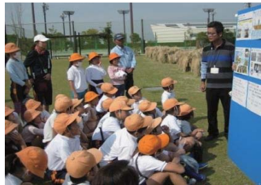
Outdoor rice farming class conducted by employees