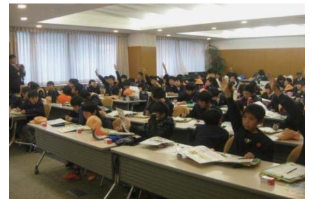
Many questions from students after the tour