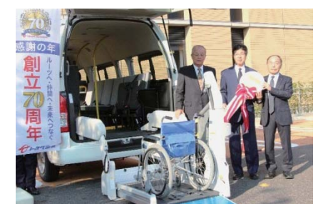
Presentation ceremony in Kariya City