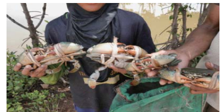
The aquatic environment has recovered to the point where shrimp, crabs, and seaweed can be cultivated.