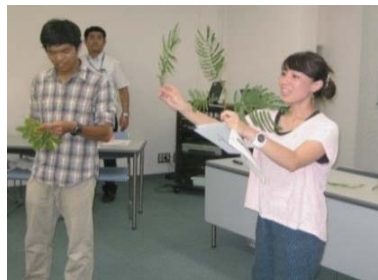
Assistant professor (right) and student from Aichi University of Education (left) instructing the class