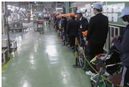
Careful attention to safety during plant tours

The three plants in total receive 6,000 elementary school students from 90 schools each year.