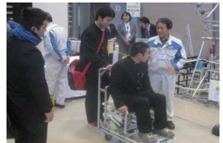
Exhibit of improvement examples at "Karakuri Exhibition in Kariya"