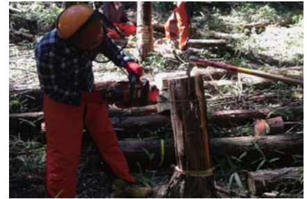
Safe woodland thinning and use of tools