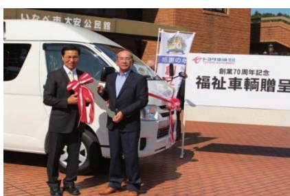
Presentation ceremony in Inabe City

Cities receiving donations: Kariya City, Inabe City, Toyota City, Chiryu City