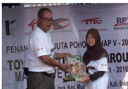
Donation of picture books at a tree-planting event ceremony

In cooperation between the Inabe City Council of Social Welfare, members of the Toyota Auto Body "Social Contribution Inabe Block", and transport support circle volunteers, activities are continuing to support activities outside the home by wheelchair users.