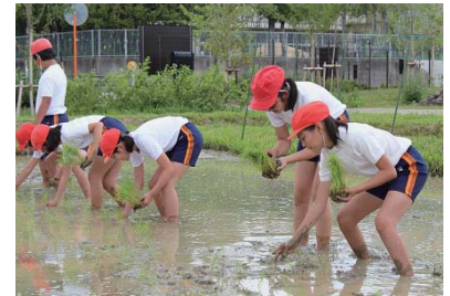
Rice planting experience