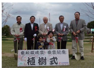
Tree-planting ceremony with the people who cooperated for the project

To commemorate this award, a ceremony was held and was attended by the vice-governor of Aichi prefecture, officials and employees of our company, local community representatives, and employee family members. Trees and flowers were planted at the ceremony to share our happiness.