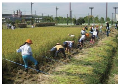
Rice harvesting experience