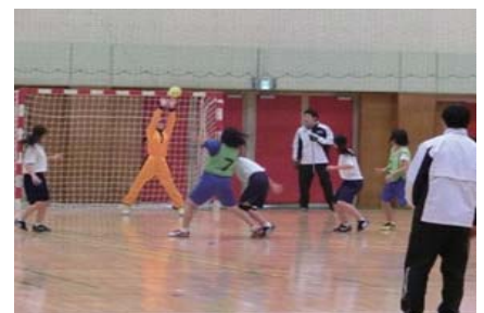
Club members serving as referees and interacting with participants