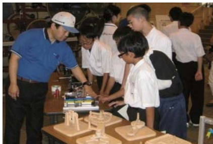
Exhibit at "Karakuri Daishugo" in Toyota City (basic mechanisms)

As one activity for raising the next generation, we provide opportunities for youth to learn about the interesting and fun nature of manufacturing. Utilizing the expertise that we have developed within our company, we have exhibited at the Karakuri Kaizen Exhibition in Kariya City, Chiryu City, and Toyota City.