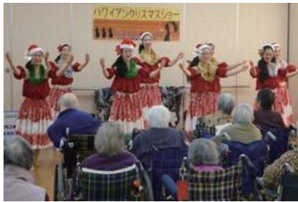
Interacting with elderly persons at a hula dance performance

The Fujimatsu Block and volunteer members of the nursing home visit circle provide shows of hula dancing, magic tricks, and other performances on visits to nursing homes for the elderly, and are providing support for disabled persons with activities including cleaning of wheelchairs, nursing care equipment, and assisted mobility vehicles.