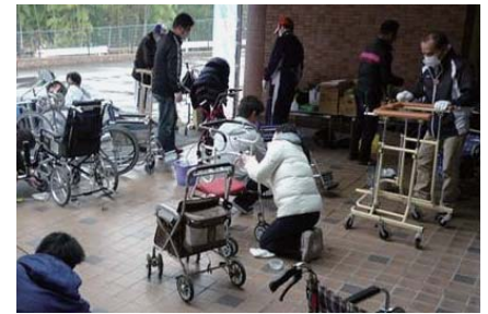
Wheelchair cleaning was started five years ago and is performed six times a year.