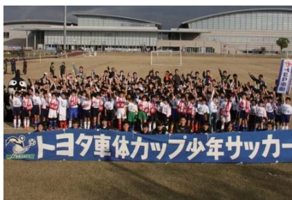
Competition with 500 participating fourth-year students from Kariya City

As part of support for youth sports in Kariya City, we have provided sponsorship and operating support for the Toyota Auto Body Cup youth soccer competition for the past 21 years. The handball club also sponsors the TAB Cup handball competition which invites junior high school teams from within and outside of the prefecture. Our employees operate the competition, meet with the players, and contribute to the promotion of sports.