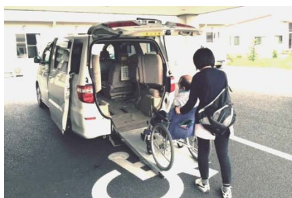
Wheelchair users in Inabe City were taken by our company's assisted mobility vehicles to the Mie Prefectural Museum in Tsu City.