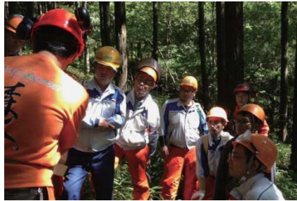
Learning about forest maintenance from an employee instructor

In addition to environmental maintenance through mangrove planting in Indonesia, cultivation of fish, shellfish, and seaweed in regenerated mangrove swamps is helping to boost local economies.