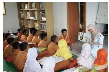
Children reading the translated and donated picture books