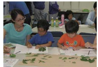
Observing plant leaves