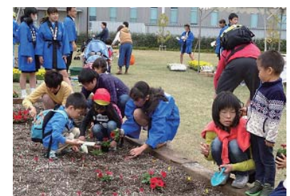
Employee families also planted flowers at the tree-planting event.